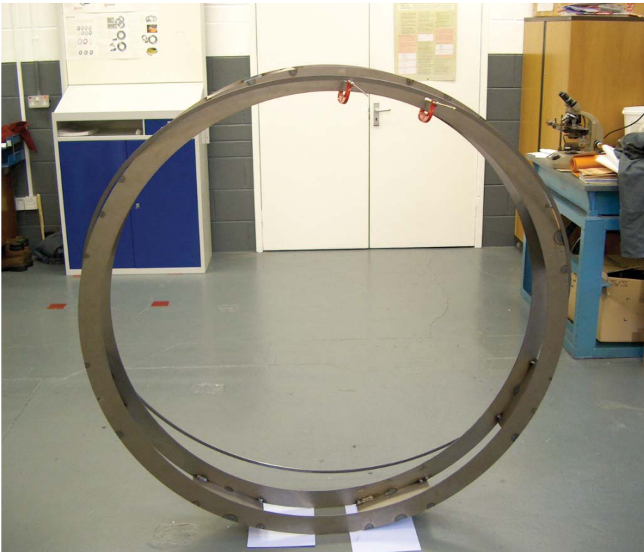
Side view of the test rig.

The results from the initial testing led to work on the modification of the Camprofile core. The core was modified in order to impart sufficient flexibility to allow the necessary manipulation over the tubesheet. A solution was found but it became clear that in manipulating the gasket over the test rig there was a risk of damage to the graphite facing. Following discussion with the client it was agreed to supply a Camprofile core only, with the graphite facing to be applied on site after fitting. A detailed method on how to apply the graphite correctly was supplied in order that the procedure could be employed on site.