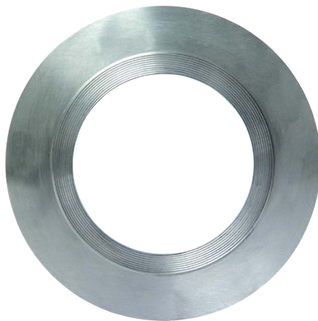
Camprofile Core. Graphite is applied on both sides to provide an excellent seal.

most suitable choice of gasket. Camprofile gaskets consist of a metal core, generally stainless steel, with concentric grooves on either side. A sealing layer, normally graphite, is applied on both sides to provide an excellent seal and to protect the flange surface from damage. Camprofile gaskets have a proven track record in sealing problematic heat exchanger applications throughout the world. The secret of Camprofile success is that the gasket focuses the available bolt load into very small concentrated, areas, forming a labyrinth of high density "gates" that are virtually impenetrable by the media. In order to function correctly, the Camprofile must be precisely machined; failure to do so will result in poor sealing performance and ultimately flange leakage.