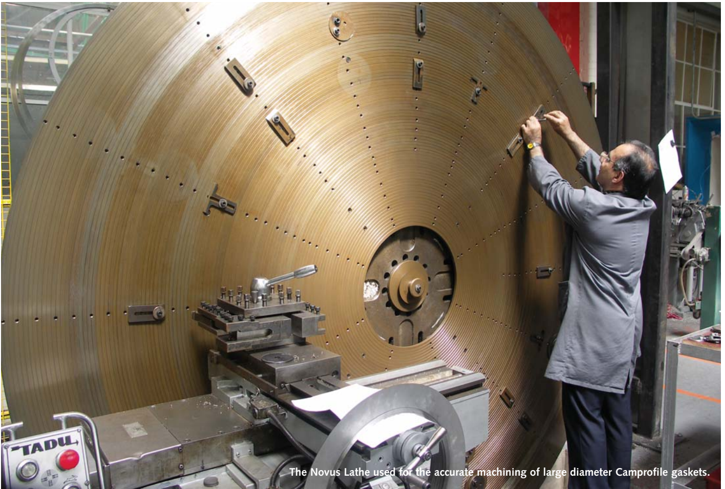
The Novus Lathe used for the accurate machining of large diameter Camprofile gaskets.