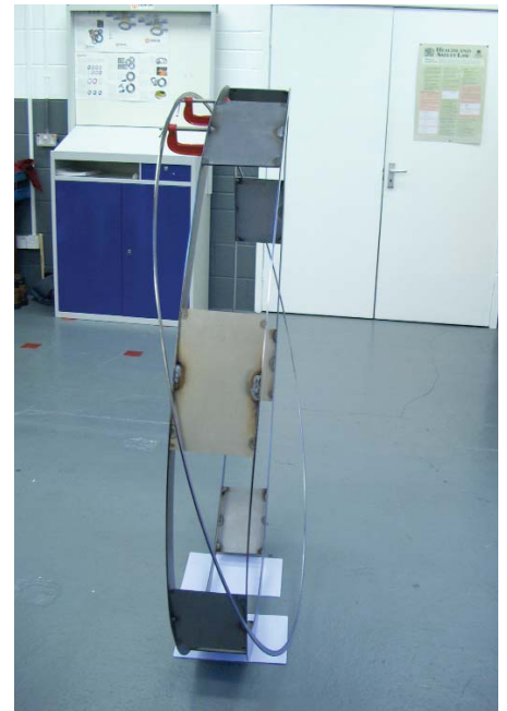
The Novus test rig designed to replicate the dimensions of the tube sheet and the restriction caused by the tubes.

Novus Sealing has an unrivalled pedigree in manufacturing Camprofile gaskets that stems from its origins as part of the Hofland Group, the company that developed the modern Camprofile gasket. This foundation has ensured that our engineers have a deep understanding of the design principles and manufacturing requirements and this knowledge assisted the company in meeting the second requirement of the application.