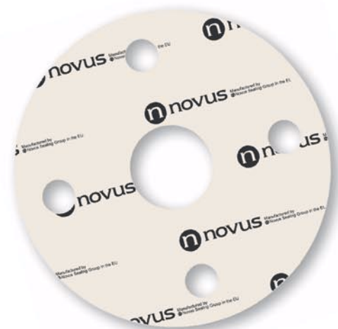
Colour - White