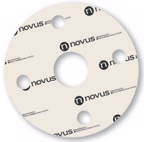
Colour - White