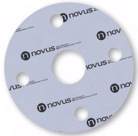
Colour - Blue