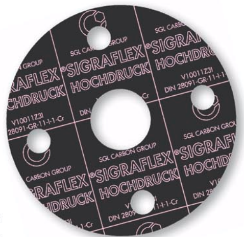
Colour - Black