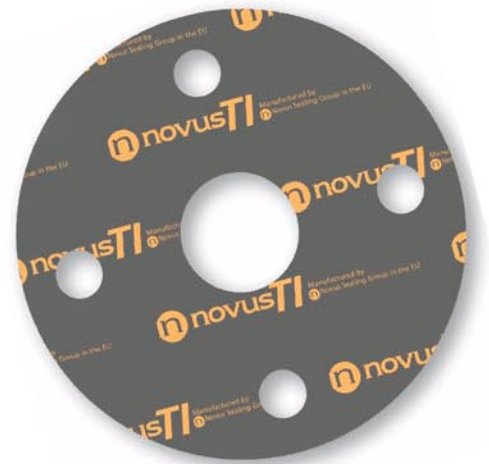
Colour - Black