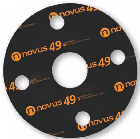
Colour - Black