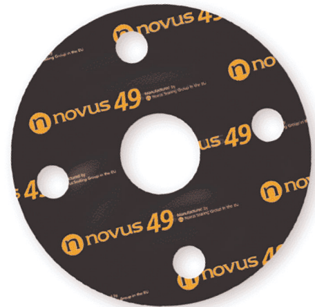
Colour - Black

Thickness range = 0.4mm to 6.0mm Standard sheet sizes = 2.0m x 2.0m, 2.0m x 1.5m, 2.0m x 1.0m, 1.5m x 1.5m, 1.5m x 1.0m. Standard roll sizes = Up to a maximum size of 6.0m x 2.0m Available with fine mesh mild steel reinforcement. Supplied with anti-stick coating as standard.