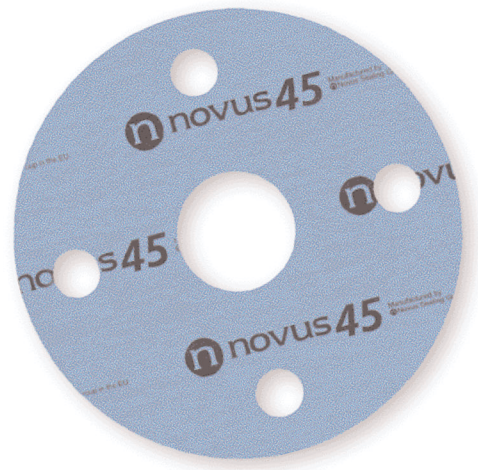
Colour - Blue