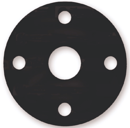
Colour - Black