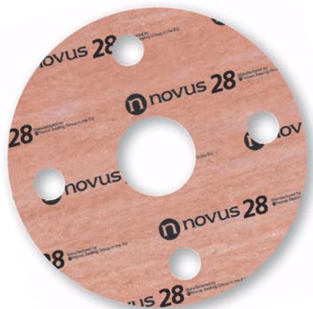
Colour - Black/Red