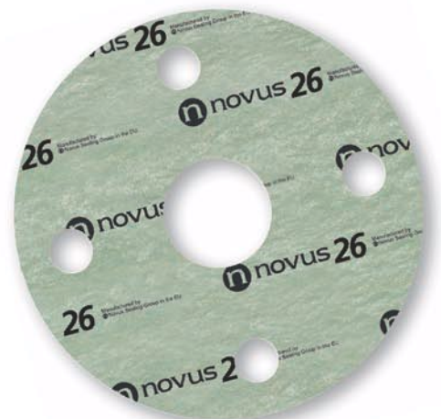
Colour - Green