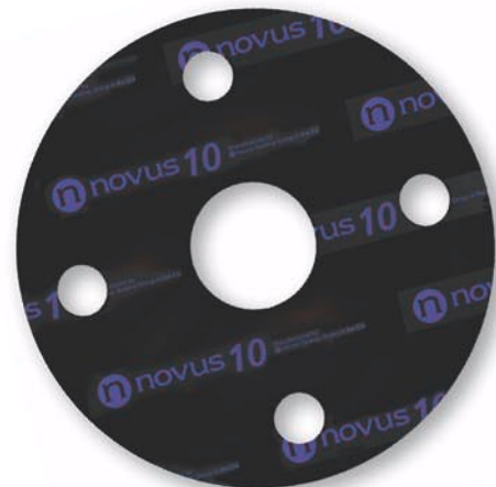
Colour - Black

Thickness range = 0.4mm to 6.0mm Standard sheet sizes = 2.0m x 2.0m, 2.0m x 1.5m, 2.0m x 1.0m, 1.5m x 1.5m, 1.5m x 1.0m. Standard roll sizes = Up to a maximum size of 6.0m x 2.0m Available with a fine mesh mild steel reinforcement: Novus 10 Metallic, it can also be supplied with anti-stick finish. Supplied as standard with anti-stick coating. Can also be supplied with graphite coating.